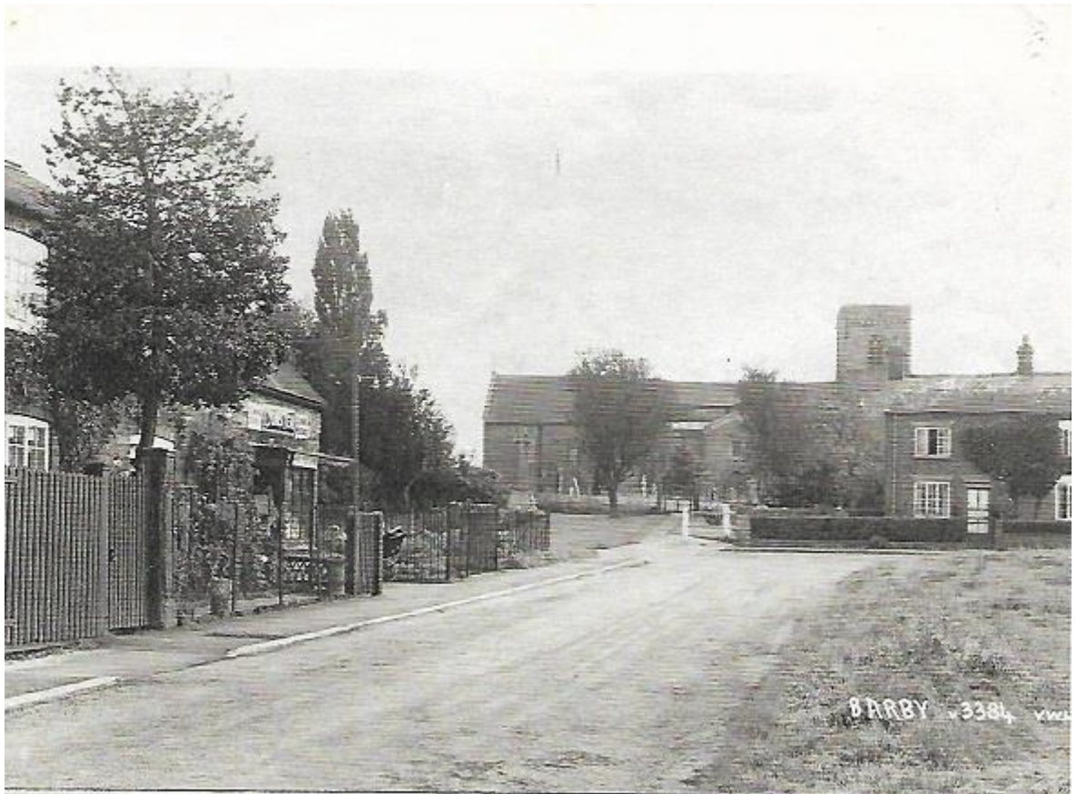
A 1950s photo of 10 The Green with the church behind: BLHG P02/090 Village Centre