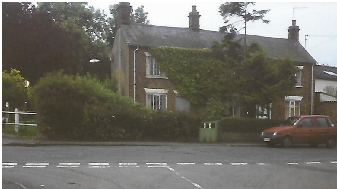
8 & 10 The Green , decidedly two houses, in 1989