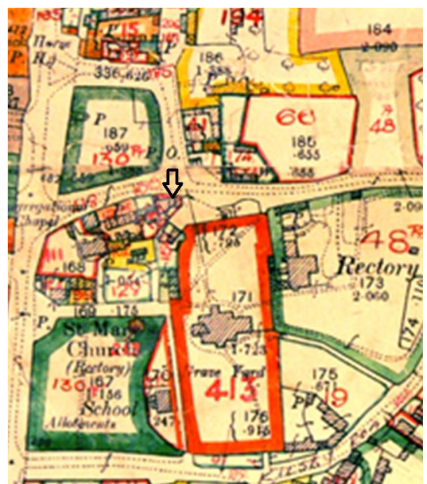
The National Archives, IR126/5/125 & IR126/5/191

This was presumably the house to be seen on the 1910 Valuation Survey map.